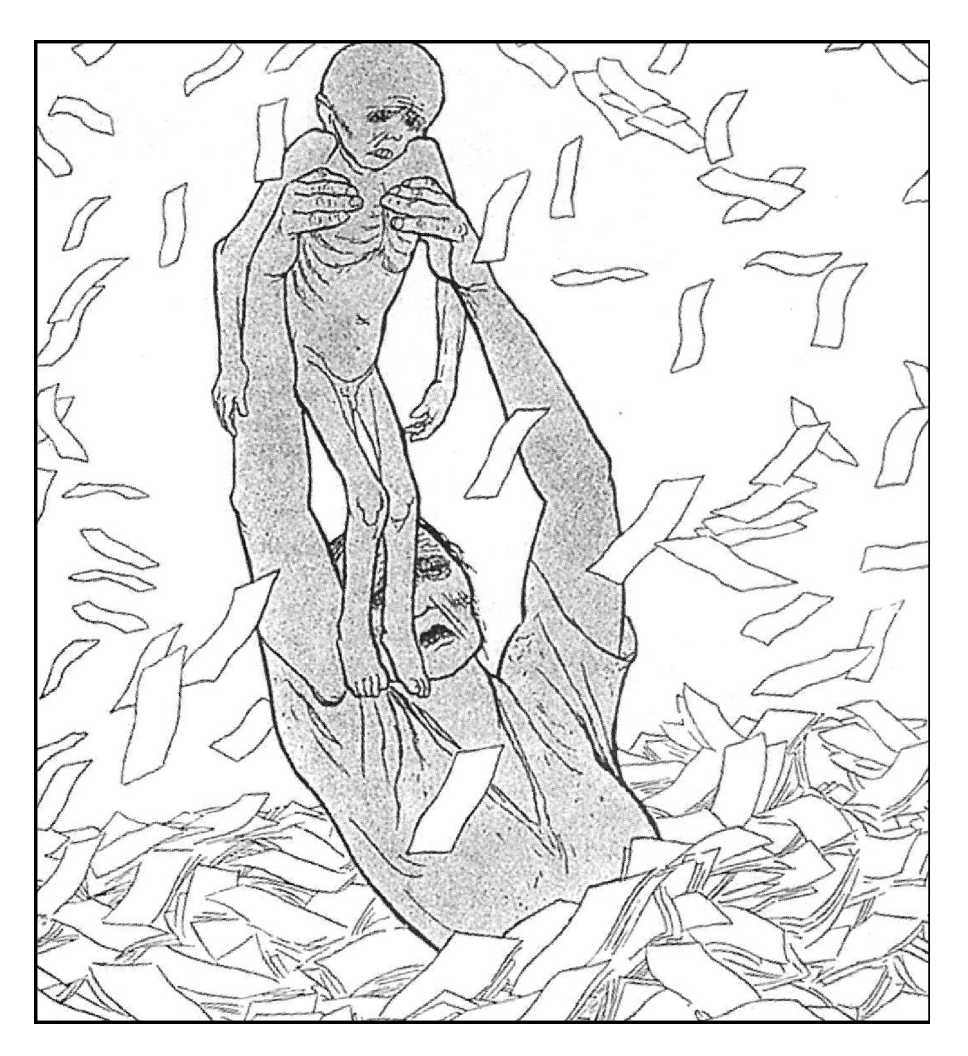
A cartoon published in Germany in 1923. The mother is shouting, 'Bread! Bread!'