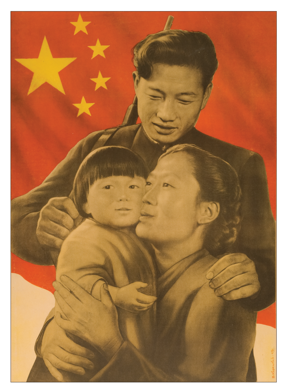
A poster published in Russia in 1950. The caption reads, 'Glory to the great Chinese people who have gained freedom, independence and happiness'.