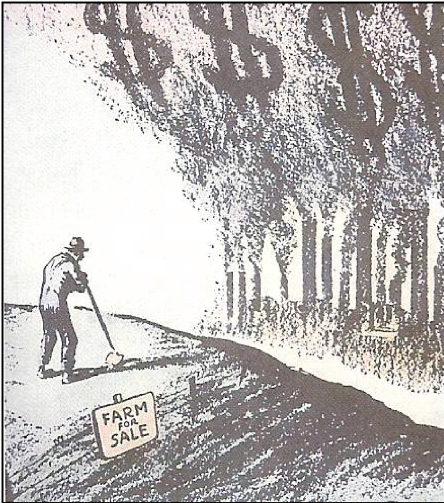
A cartoon published in the USA in the 1920s.