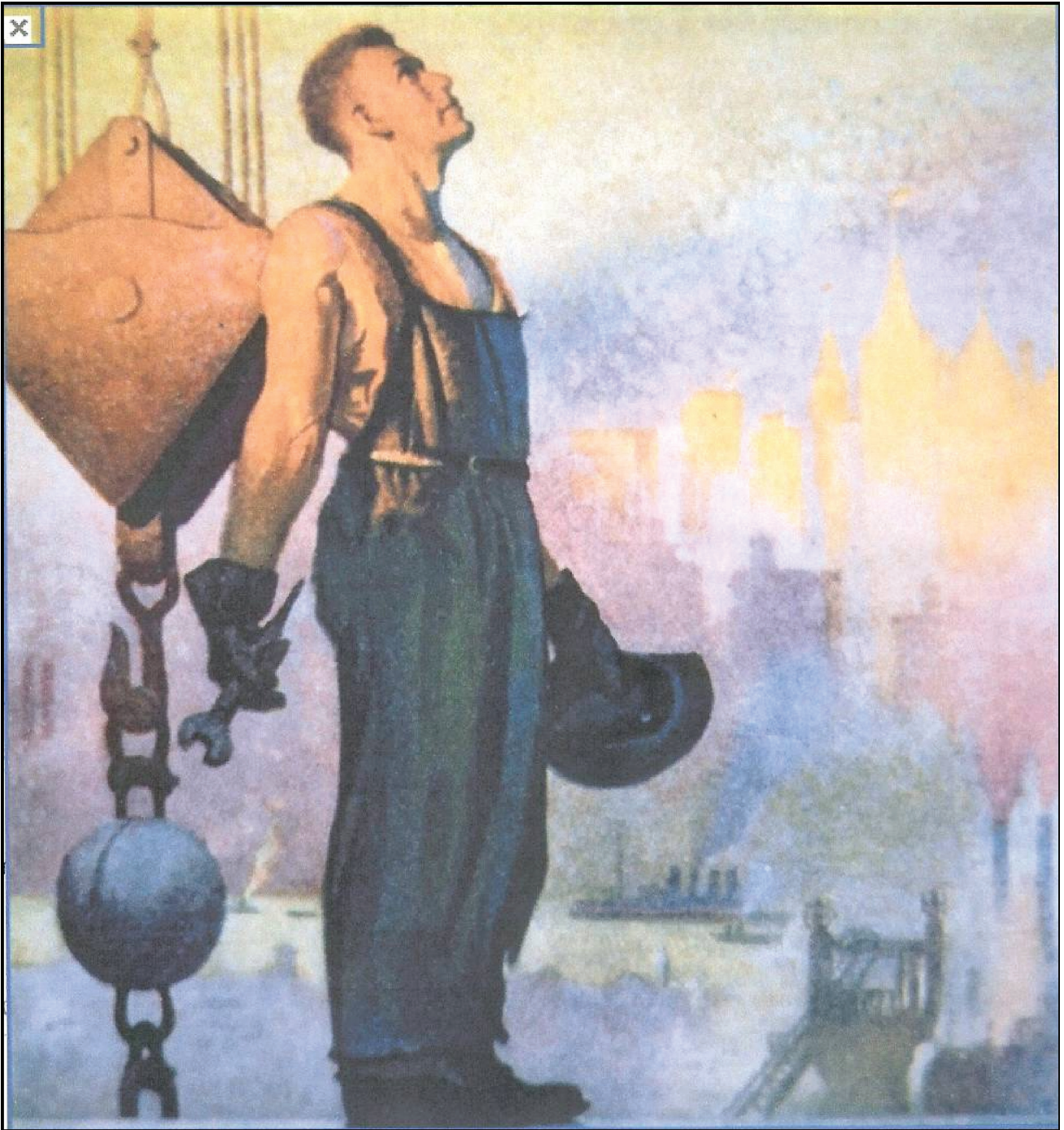
A painting entitled 'The Builder'. It was produced in America in the 1920s.