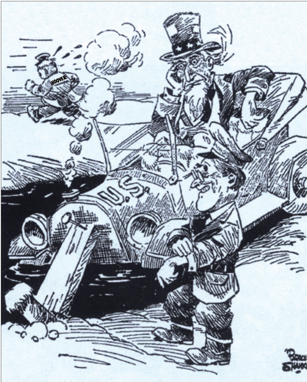
An American cartoon entitled 'The New Driver' published in 1933. The figure at the bottom of the cartoon represents Roosevelt.