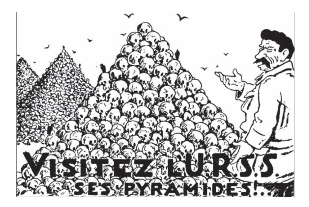
A cartoon published by Russian exiles in France in the late 1930s. The text reads, 'Visit the USSR's pyramids'.