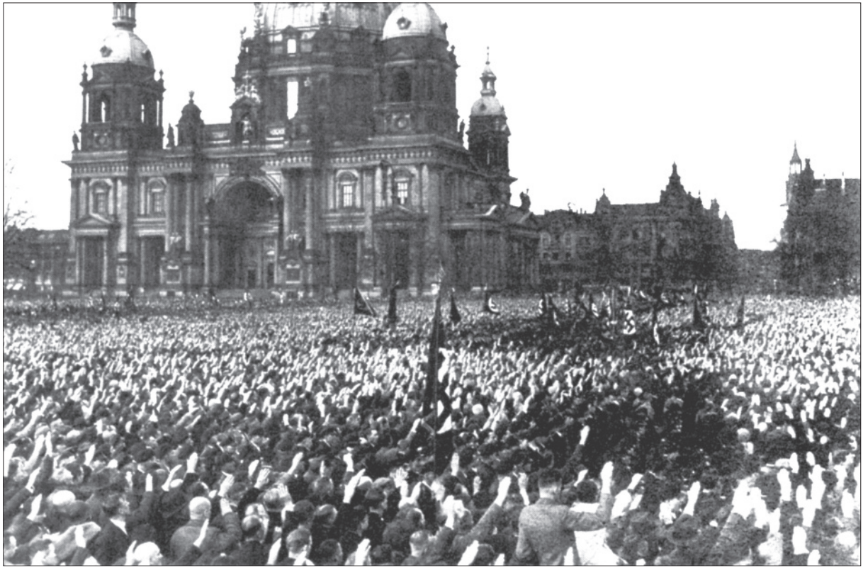
A large crowd listening to Hitler speaking in Berlin, 1932.