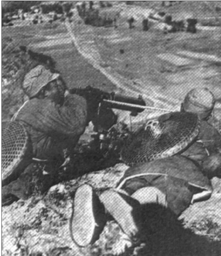
A photograph of Red Army soldiers setting up an ambush.