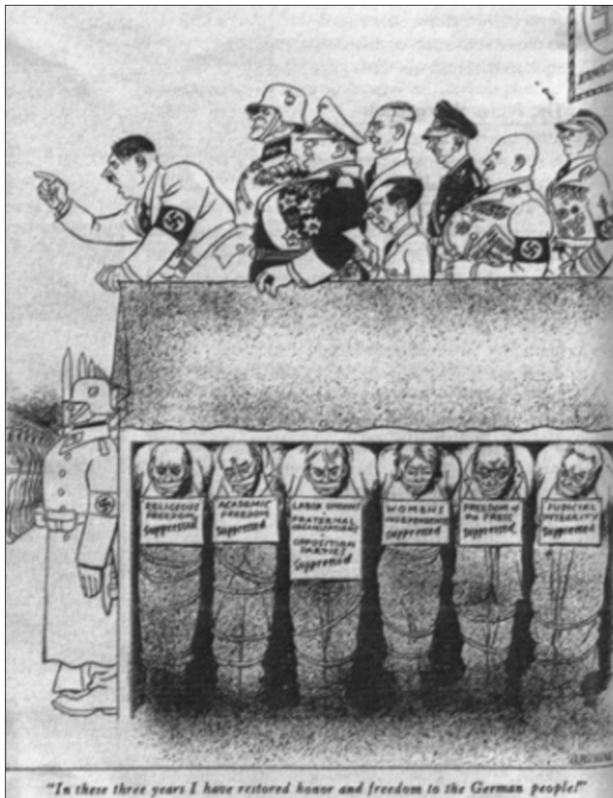
A cartoon from an American newspaper in 1936.