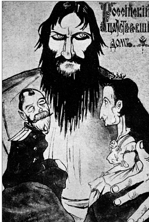
A cartoon about Rasputin, published in Russia. The words say 'The Russian Tsars at home'.