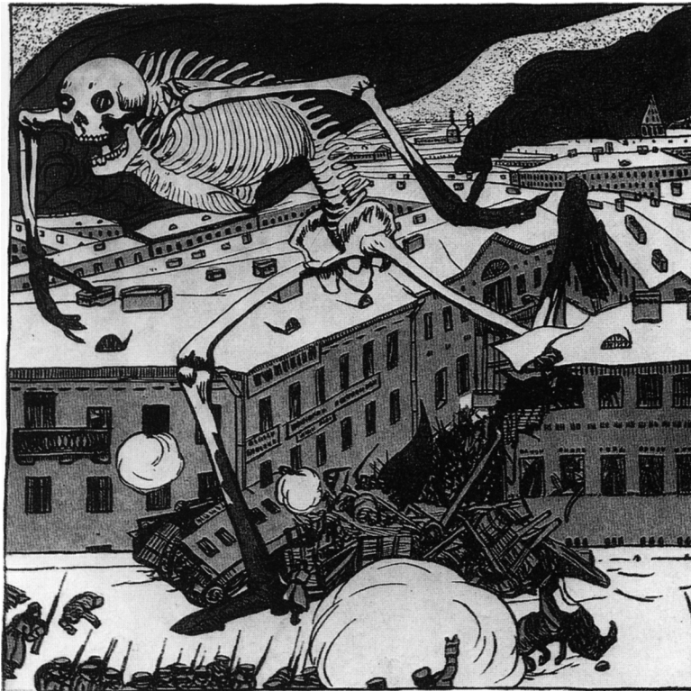
A cartoon about Bloody Sunday. It was published in a Russian political magazine in 1905. The skeleton represents the forces of the Tsar.