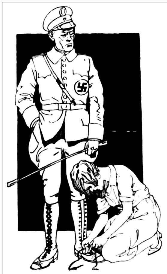
A Social Democrat poster published in 1931. It suggests what life will be like for women under the Nazis.