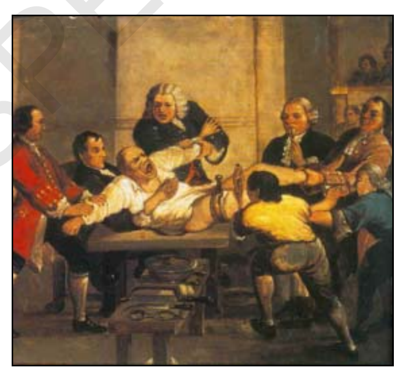
An illustration of a man having his leg amputated around 1800.