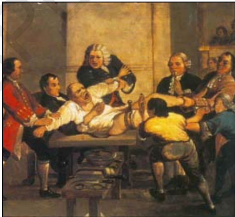
An illustration of a man having his leg amputated around 1800.