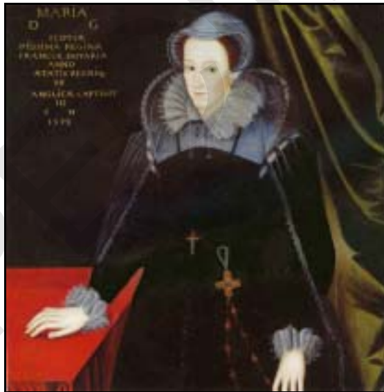
A portrait of Mary, Queen of Scots, painted in 1578. The words in the top left-hand corner describe her as 36 years old, the Queen of Scotland, widow of the King of France, and a prisoner in England.