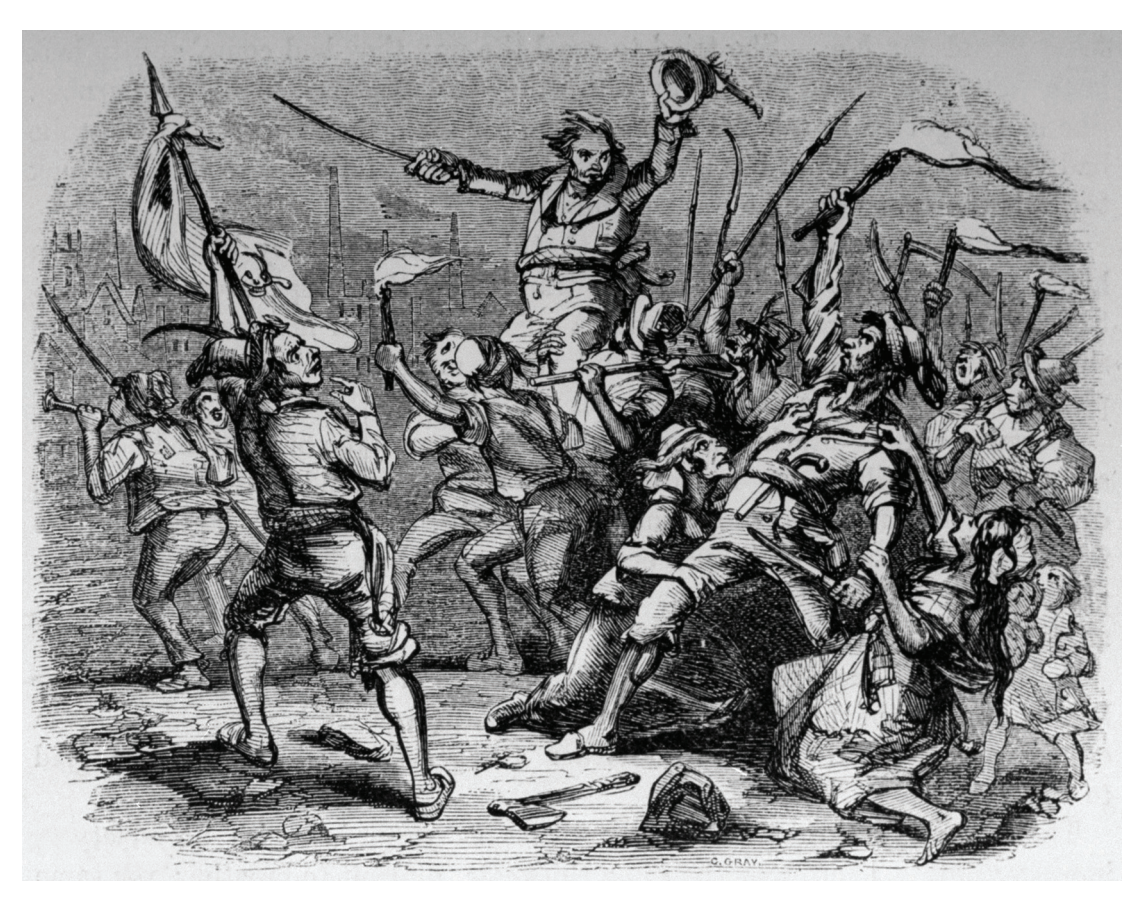
An engraving of Luddites, published in 1813.