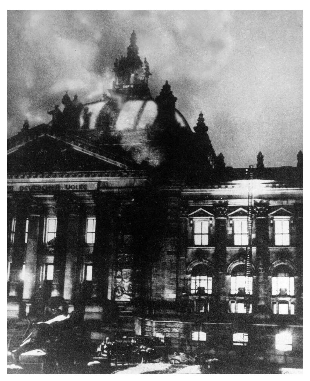
A photograph, published by the Nazis, of the Reichstag building on fire in February 1933.