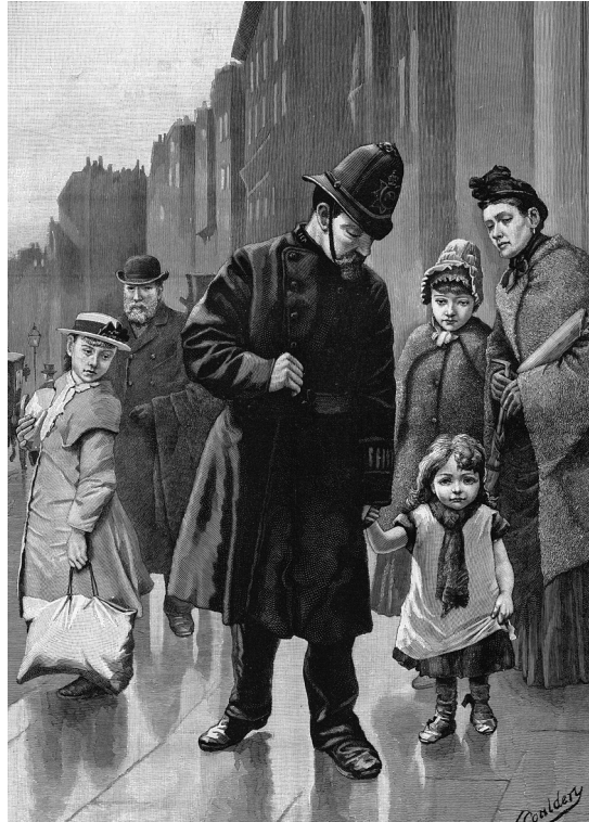
A picture, entitled 'Lost in London', published in a London magazine in 1888.