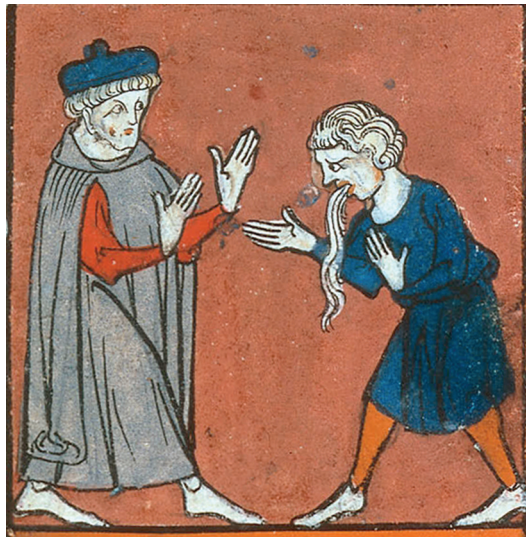
A drawing from the Middle Ages showing a patient vomiting after being given a purgative by his doctor.