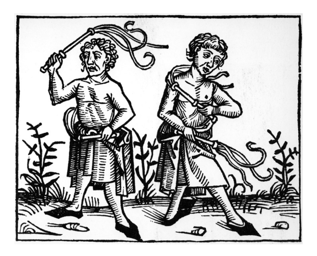
A fourteenth-century drawing of people whipping themselves.