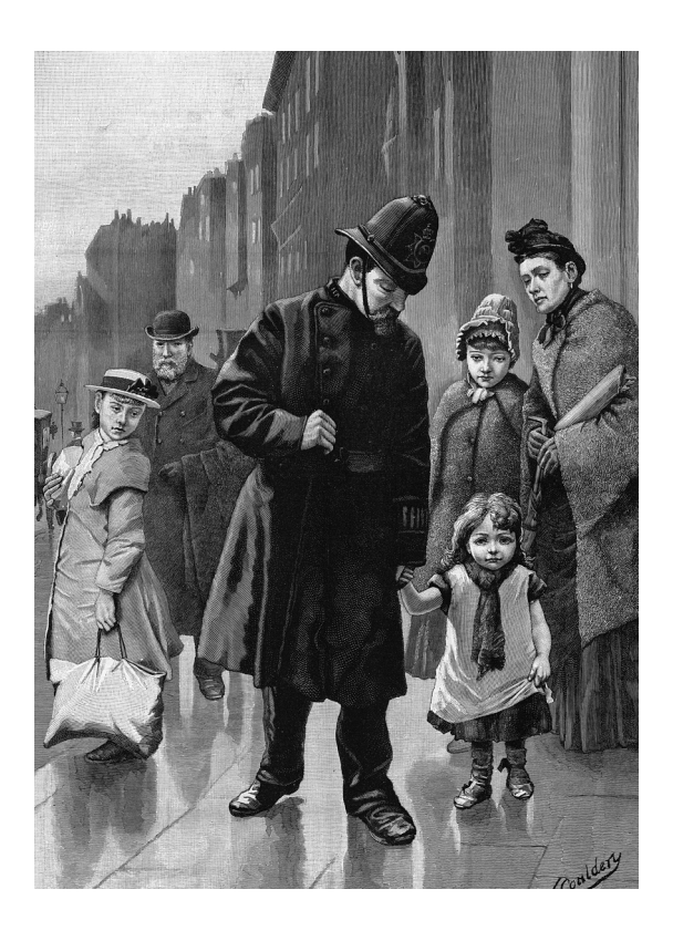
A picture, entitled 'Lost in London', published in a London magazine in 1888.