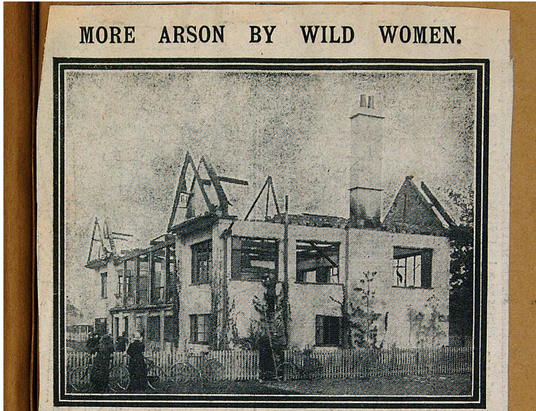
A newspaper photograph from 1913 showing the athletics pavilion of the University of Bristol, burnt down in an arson attack. It was claimed that Suffragettes were responsible for the attack.