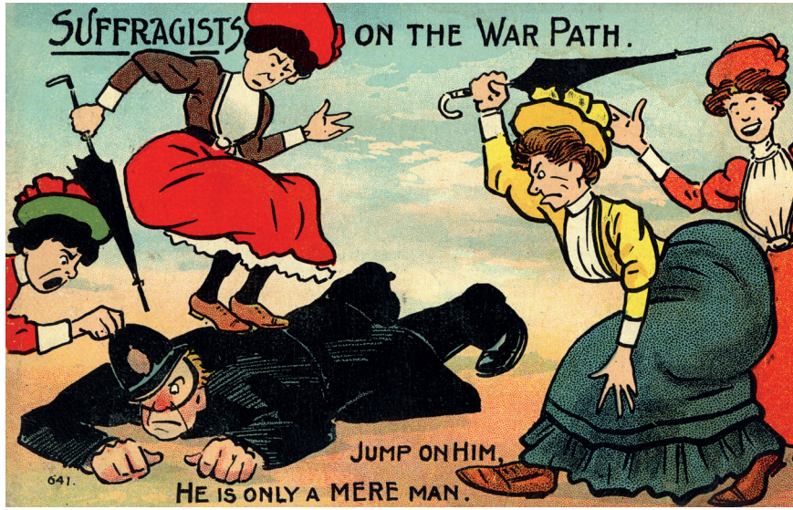
An early twentieth-century cartoon.