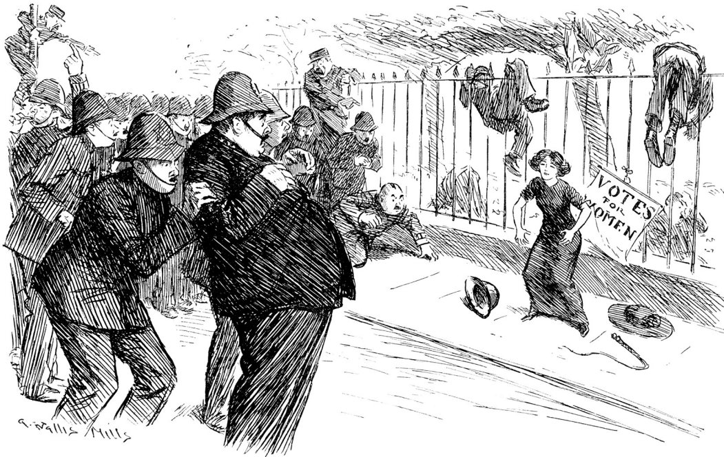
THE SUFFRAGETTE THAT KNEW JIU-JITSU. THE ARREST