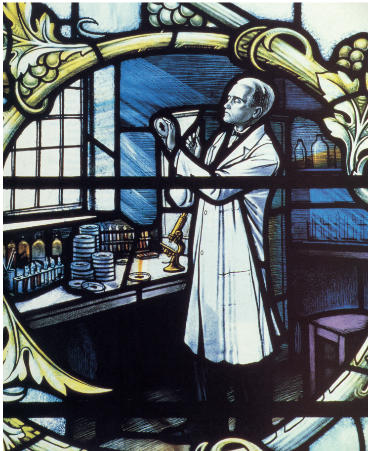
Stained glass window showing Fleming in his laboratory. It was installed in St James' Church, London, close to St Mary's Hospital, where he had worked for 49 years.