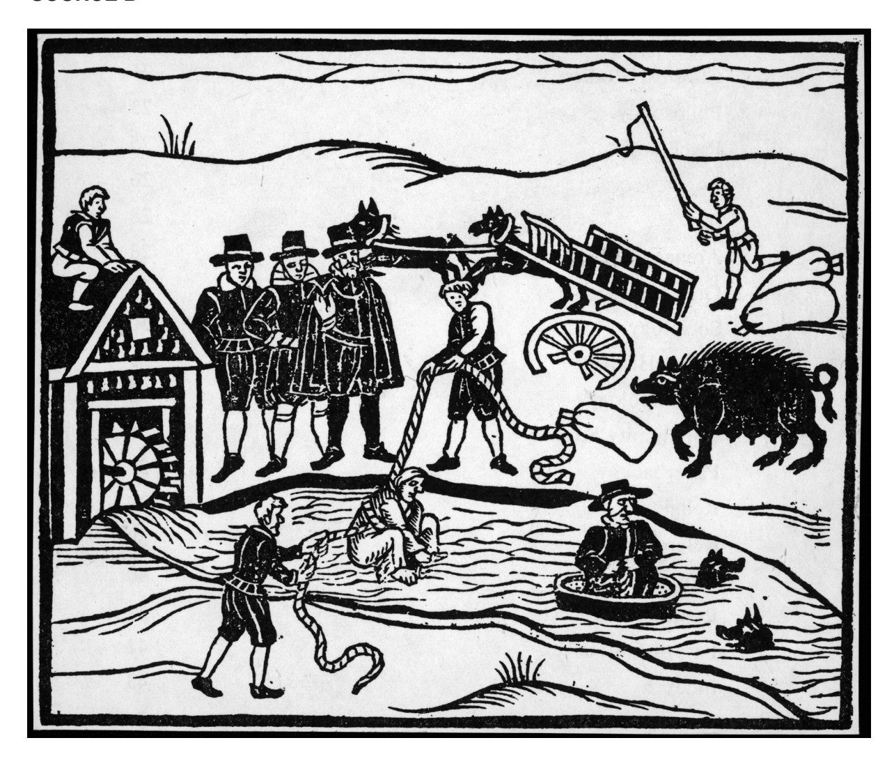
A drawing from the seventeenth century.