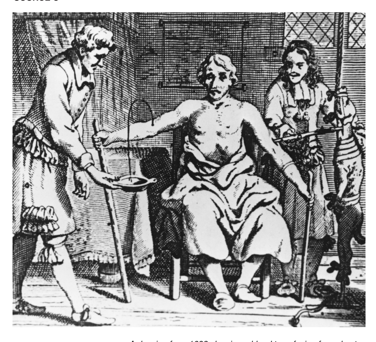
A drawing from 1693 showing a blood transfusion from dog to man.