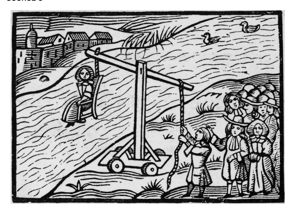
A drawing from the seventeenth century.