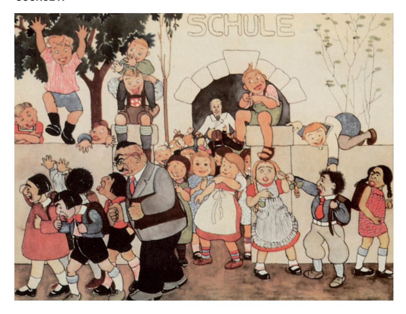
A cartoon published in a children's book in Germany in 1938.