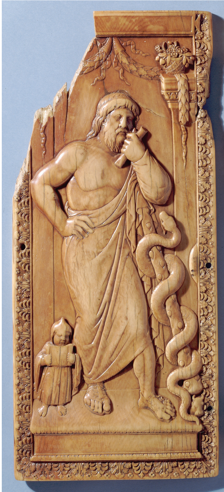
A Roman statue of Asclepius from the early fifth century AD.