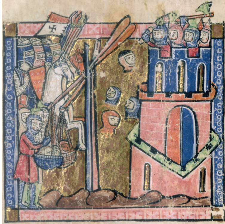
An illustration from around 1098. It shows Crusaders laying siege to a town. They are bombarding it with diseased heads.