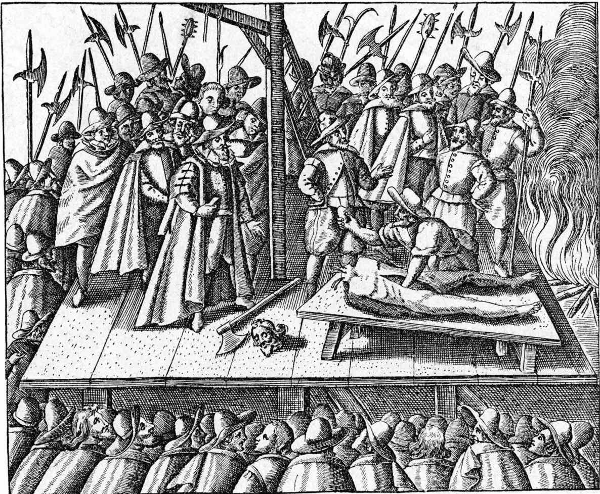
A print published at the time showing the execution of the gunpowder plotters in 1605. Prints like these were cheap to buy and sold in great numbers.