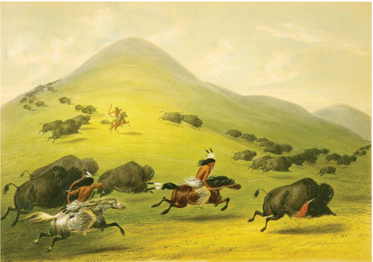
A painting from the 1830s by George Catlin.