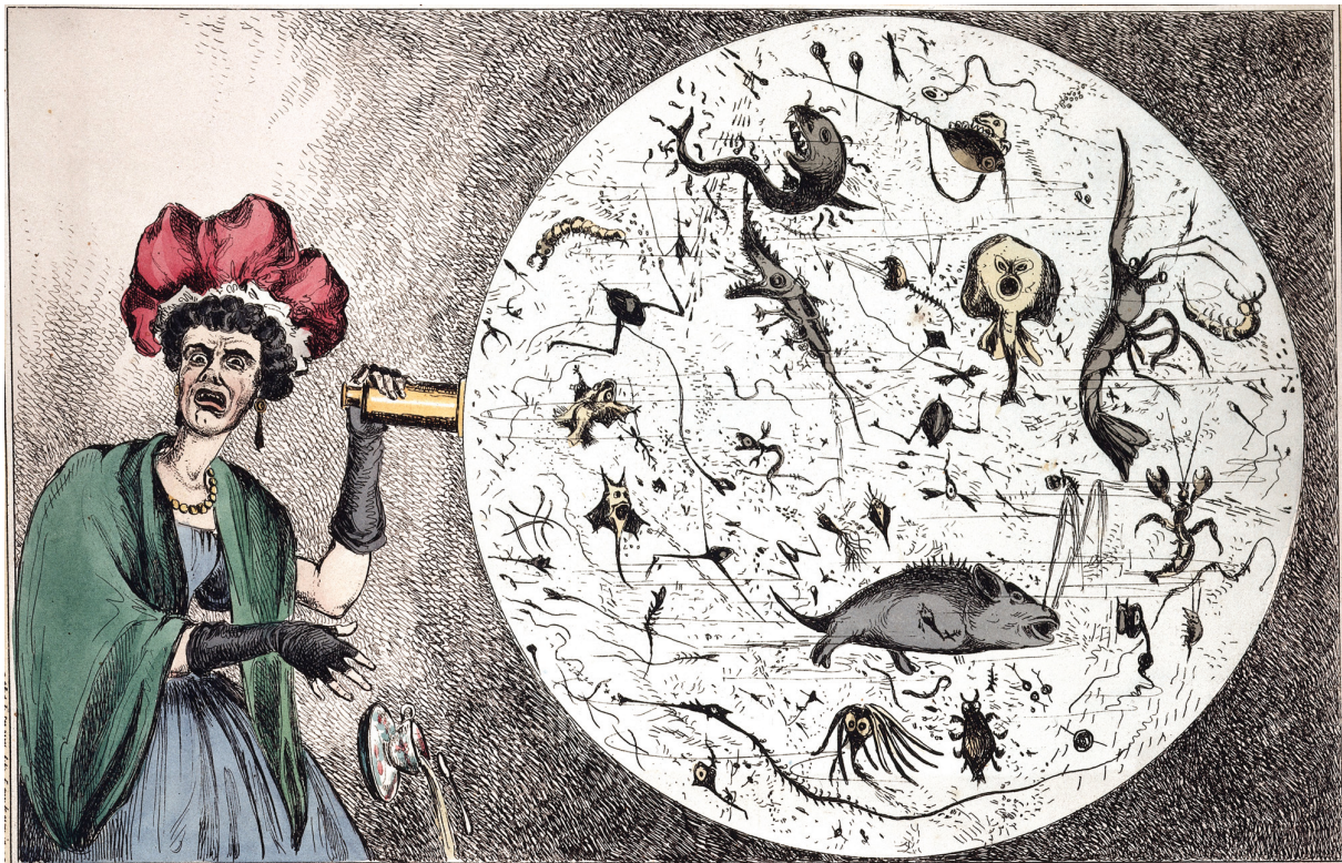
An engraving from the early nineteenth century. Its caption was 'Monster soup commonly called Thames Water, being a correct representation of that precious stuff doled out to us!'