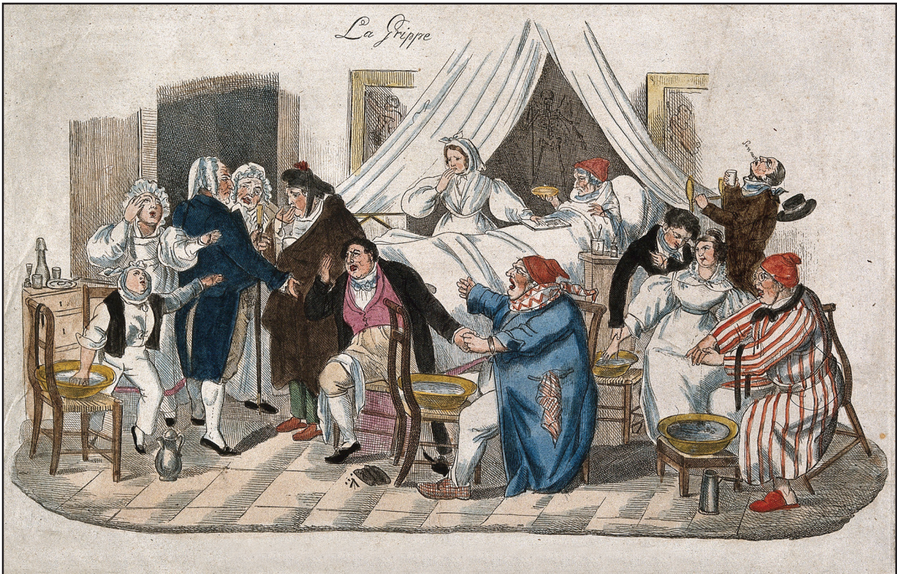
An illustration from the early nineteenth century. It shows a doctor bleeding a family to avoid influenza.