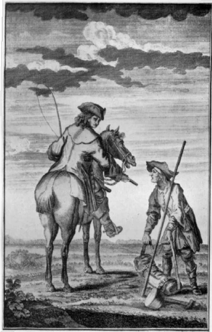
A picture from a book published in 1734 of a highwayman robbing a tinker (a poor tradesman who travelled around mending metal tools for his customers).