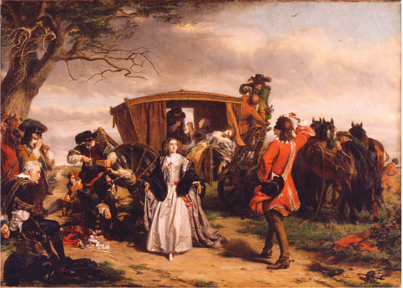
A painting from 1860 of a highwayman robbing a coach.