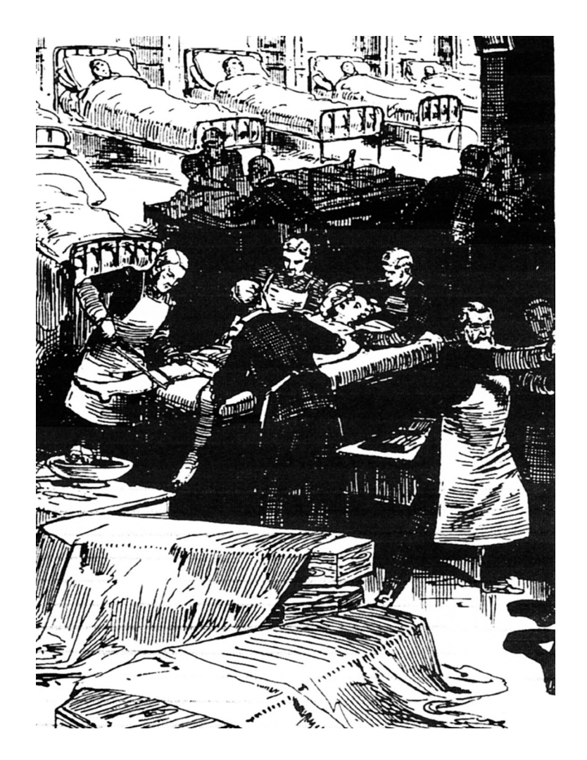
A cartoon entitled 'Operation Madness' published in 1870.