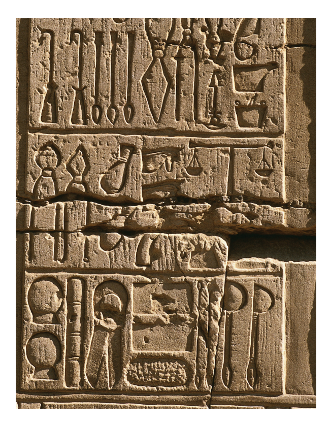
Egyptian carvings of surgical instruments found in the temple of Kom Ombo. The carvings date from about 100Bc.