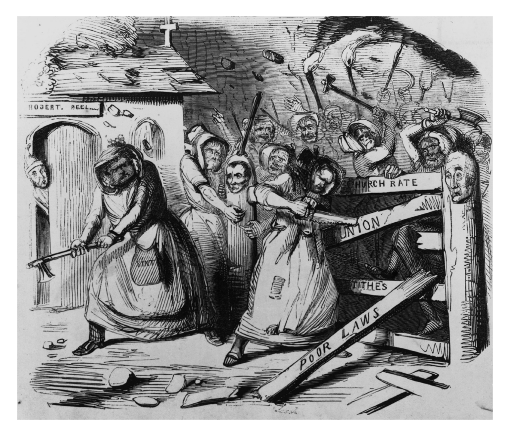
A cartoon about the Rebecca Riots published in a London newspaper in 1841. The gatekeeper is Robert Peel who was Prime Minister at the time. The faces on the gate posts represent members of his government.