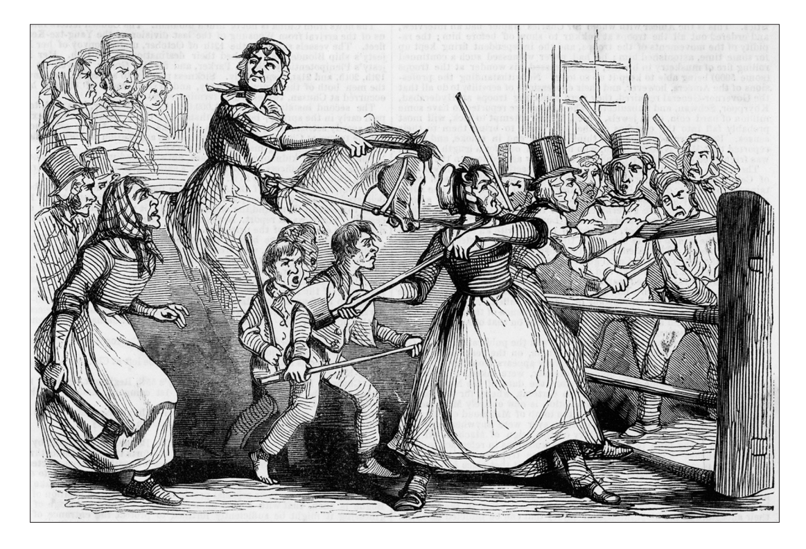
A cartoon about the Rebecca Riots published in a London newspaper in 1839.