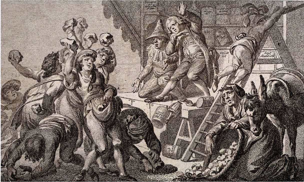
A cartoon from 1798. A travelling medicine seller and his assistants are being pelted with stones by the audience.