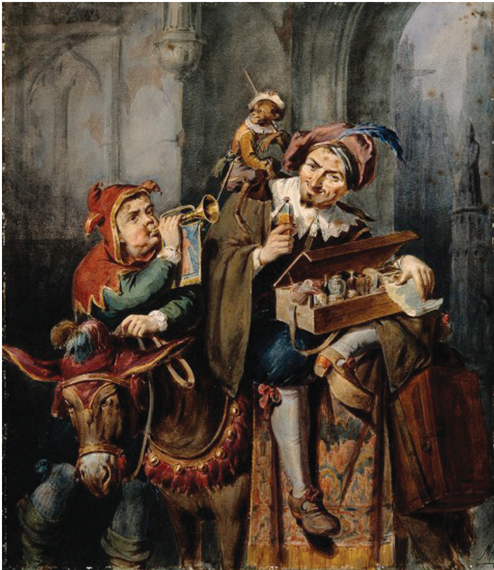
A painting of a travelling quack doctor from around 1800.