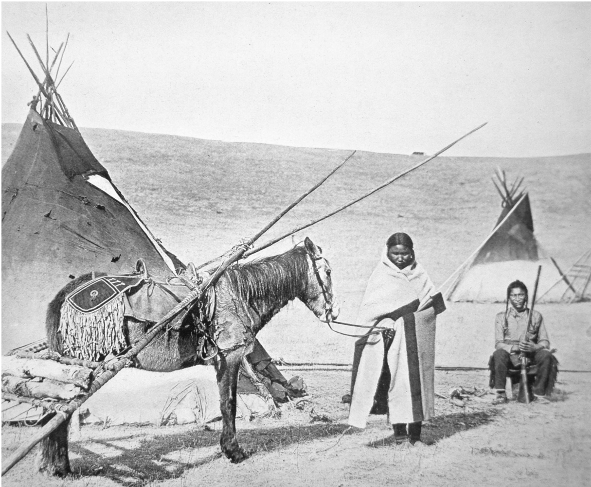
A photograph of Plains Indians.