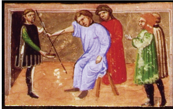
An illustration from a book by Ibn Sina. Ibn Sina was a Muslim doctor who lived between 980 and 1037. He never visited Europe.