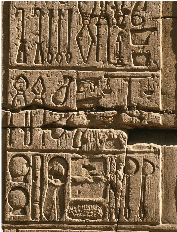
Egyptian carvings of surgical instruments found in the temple of Kom Ombo. The carvings date from about 100BC.