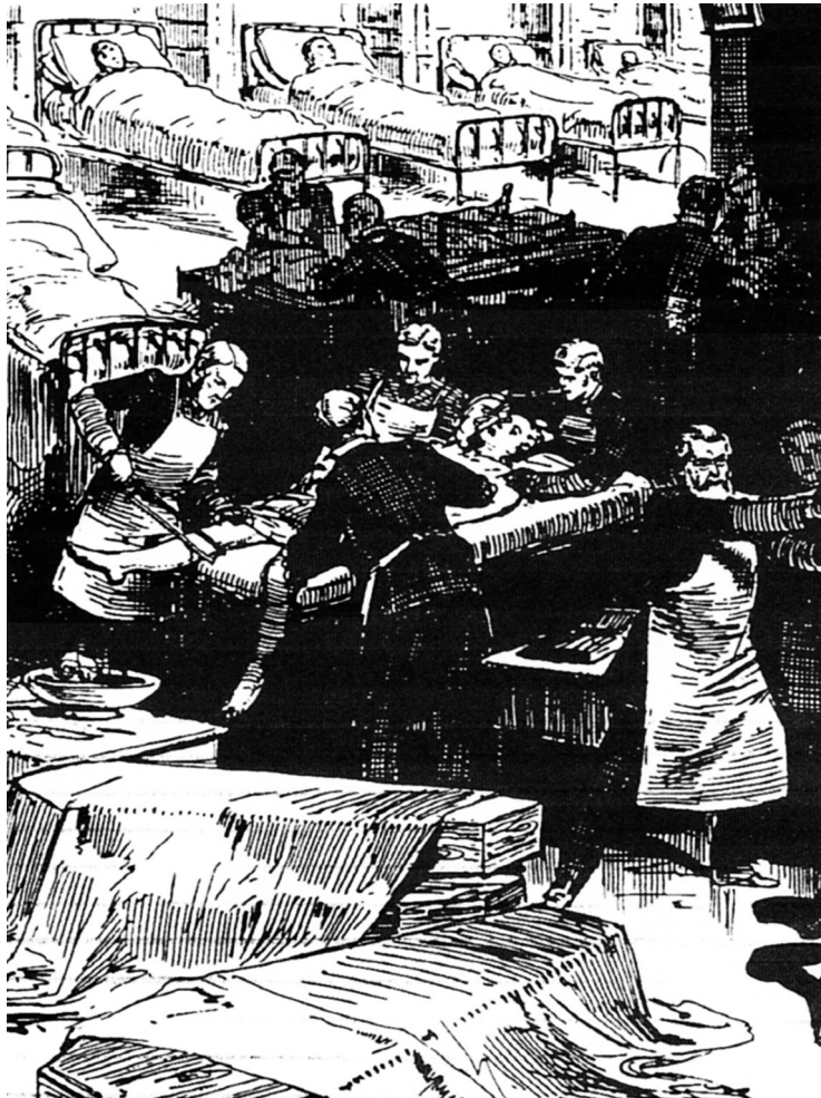
A cartoon entitled 'Operation Madness' published in 1870.