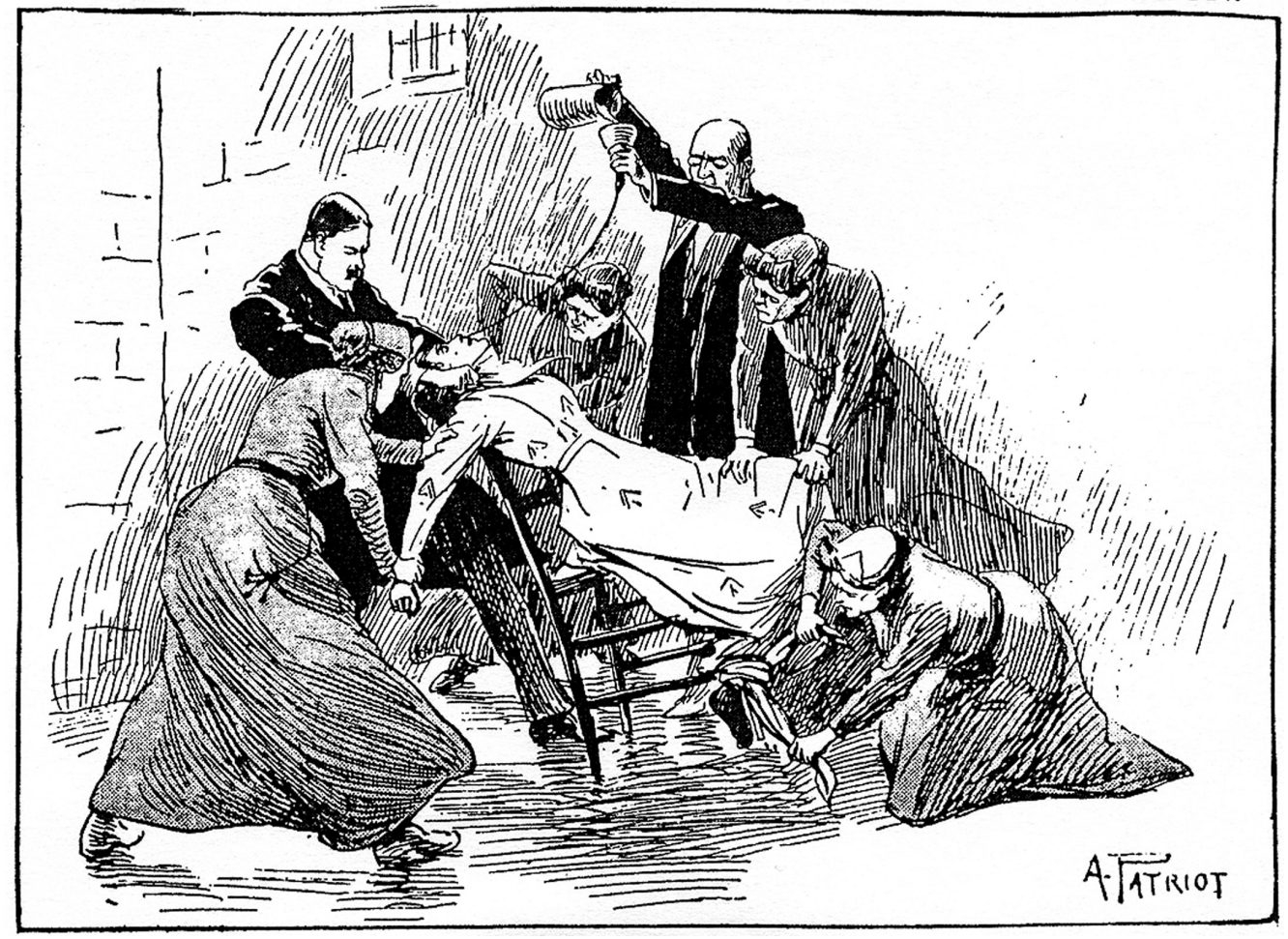
From the front cover of a journal called 'Votes for Women', January 1910.