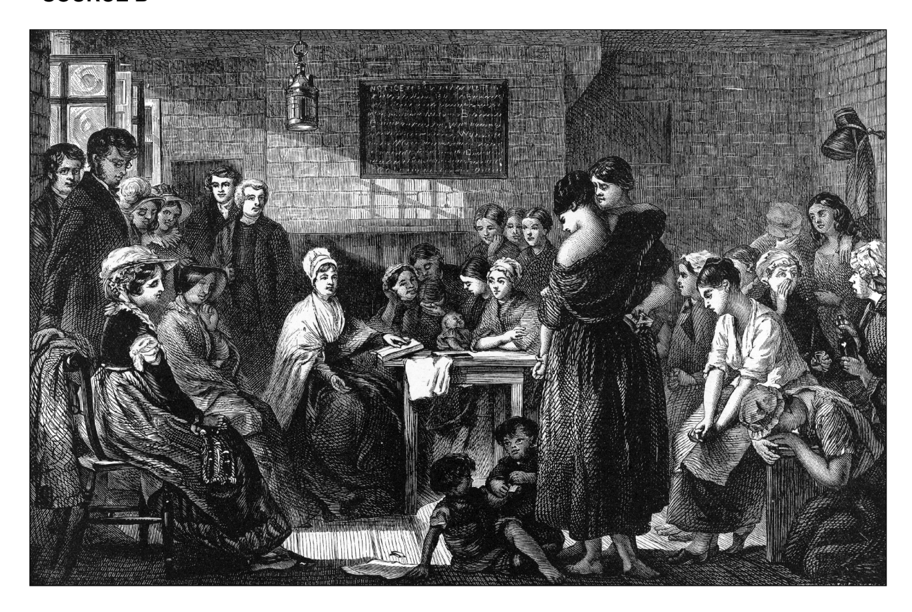
A nineteenth-century illustration of Elizabeth Fry in Newgate prison.