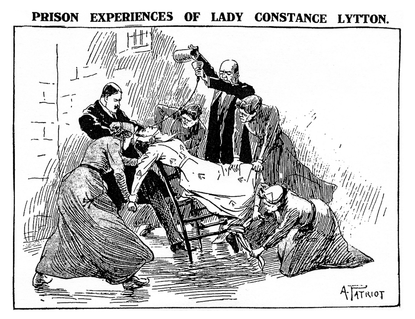
From the front cover of a journal called 'Votes for Women', January 1910.