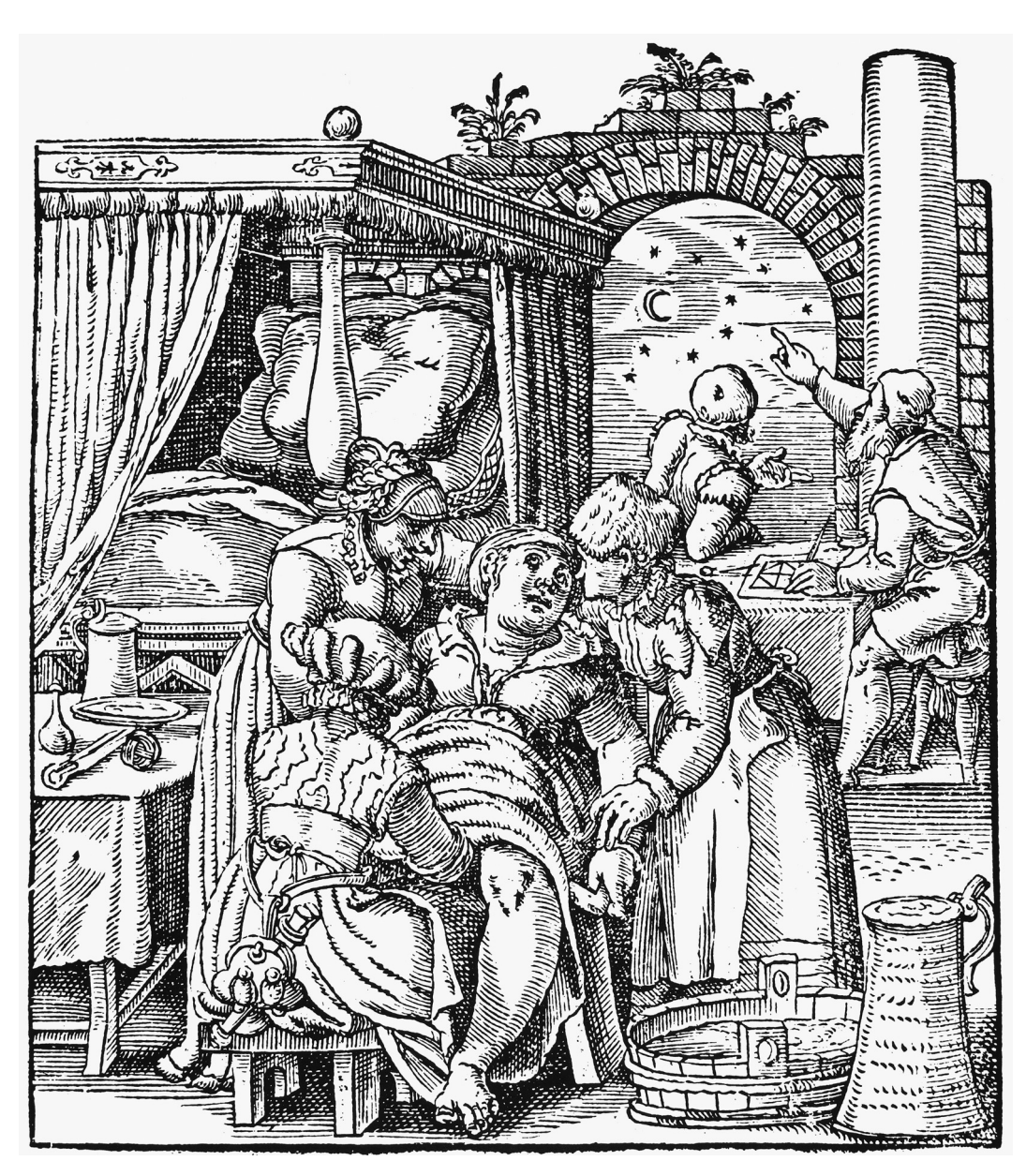
An illustration from 1580. It shows a woman giving birth helped by midwives, while the doctors can be seen in the background.