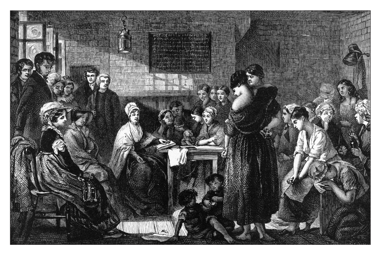
A nineteenth-century illustration of Elizabeth Fry in Newgate prison.