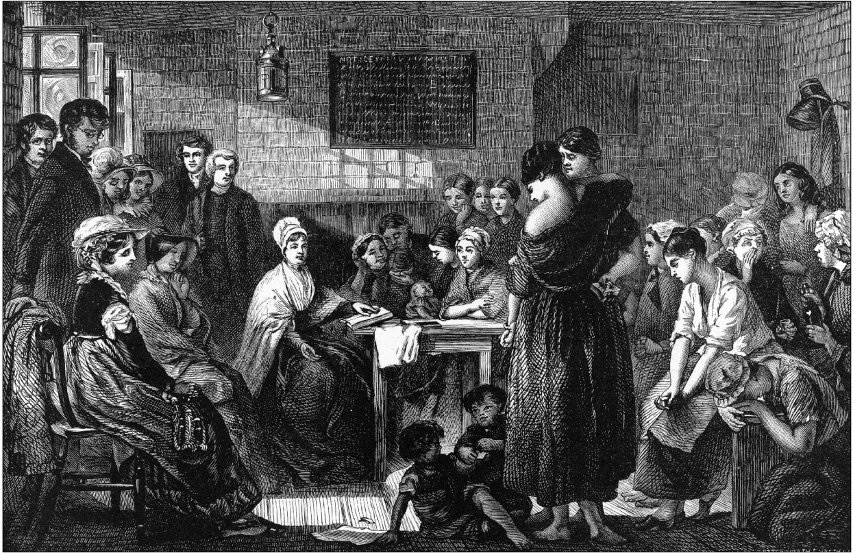
A nineteenth-century illustration of Elizabeth Fry in Newgate prison.