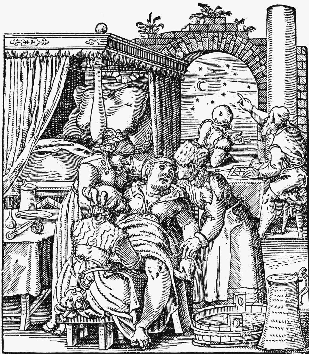
An illustration from 1580. It shows a woman giving birth helped by midwives, while the doctors can be seen in the background.