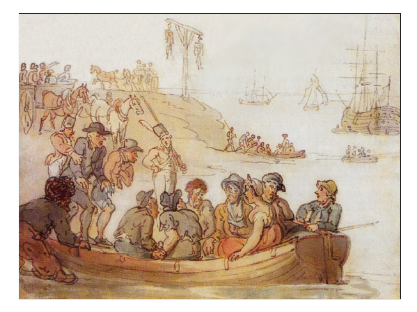
A drawing from 1787 entitled 'Convicts Embarking for Botany Bay'. Hanging, which was the alternative punishment to transportation, is shown in the background.