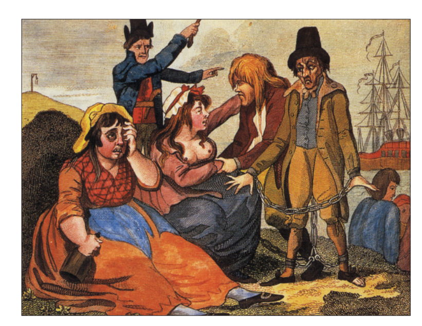
An engraving from 1792 entitled 'Farewell to Black-eyed Sue and Sweet Poll of Plymouth'. It shows convicts, about to be transported, saying goodbye to their lovers.