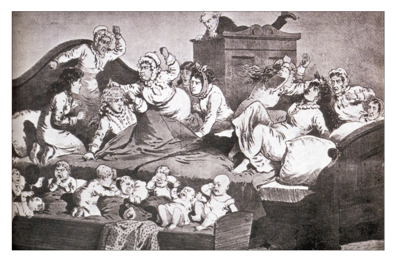
A cartoon about the Mormons published in America in the 1840s.