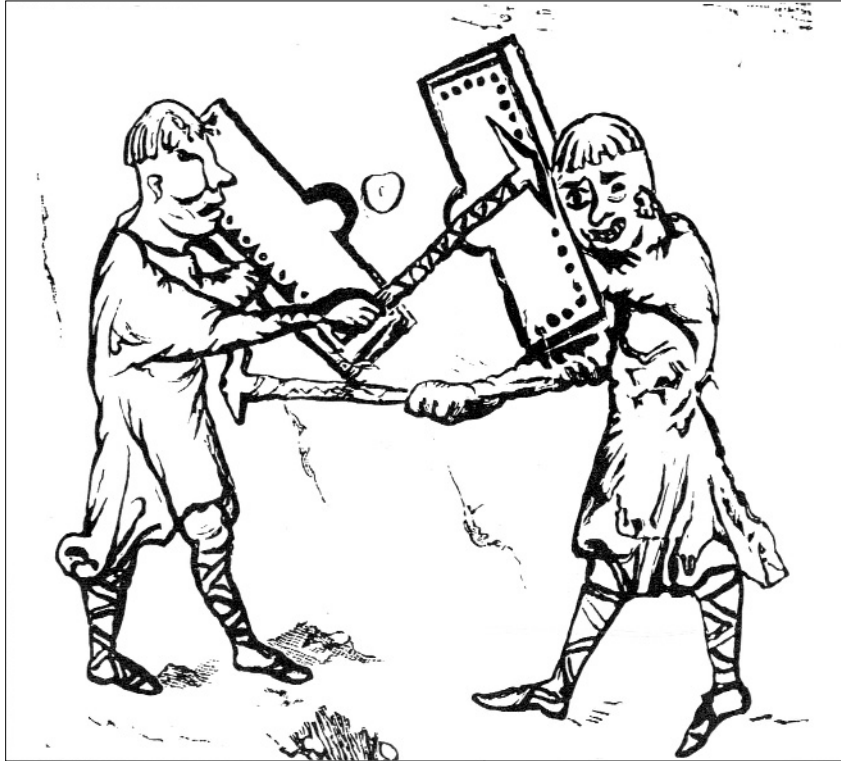
A medieval drawing of trial by battle.