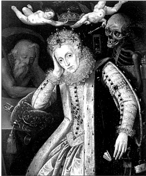
A portrait of Elizabeth in old age painted in 1620.