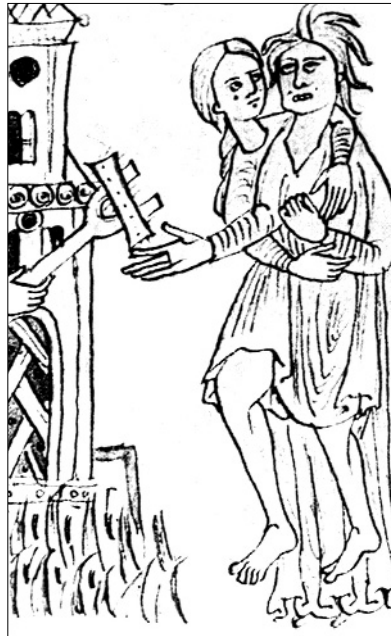
A medieval drawing of trial by ordeal.