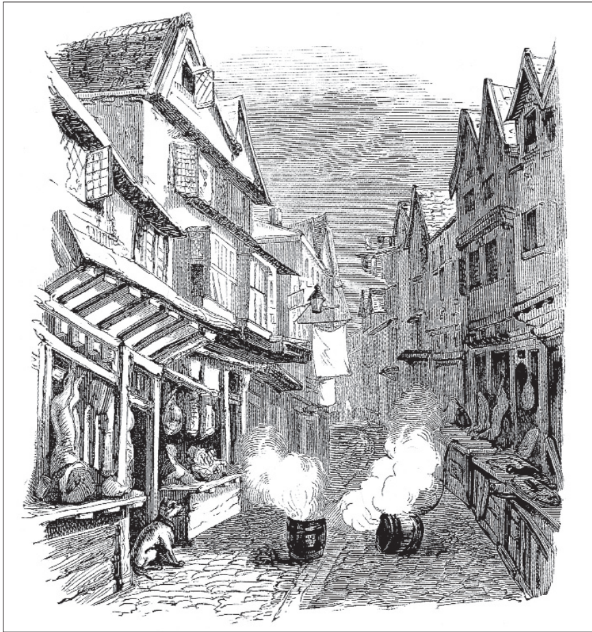
A drawing of barrels of tar being burnt in 1832 at the time of an outbreak of cholera.