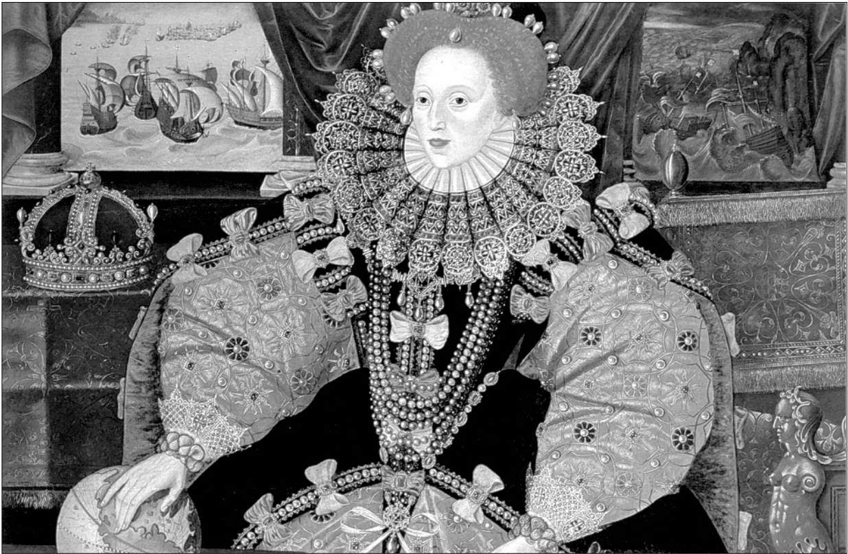
A portrait of Elizabeth painted in 1588.