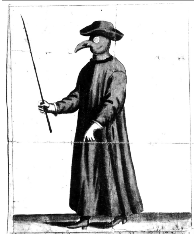
A drawing of a doctor during the plague in the fourteenth century. The 'beak' was filled with sweet-smelling substances.