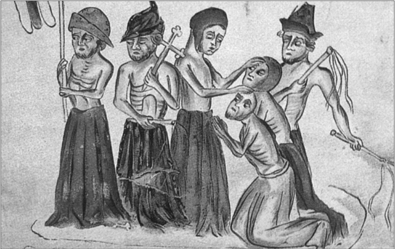
A group of flagellants whipping themselves during the plague in the fourteenth century.