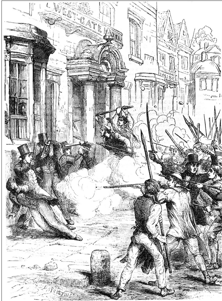
A painting of the Chartists in Newport in 1839.