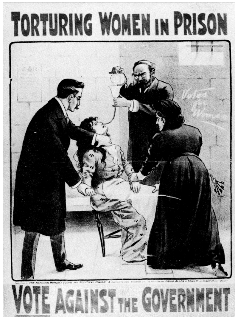
A poster published in 1912.