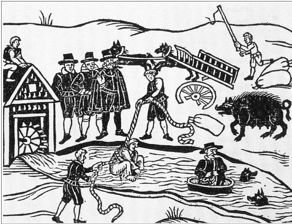
A seventeenth-century woodcut showing a woman being made to take the 'floating and sinking ordeal'.