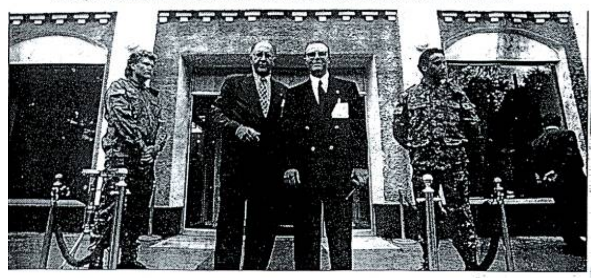
Rough ride: Businessmen need both a bodyguard and an 'analyst' to detect murder plots.

Since 1991 there has been a tremendous growth in crime in Russia. Russian crime is dominated by the Mafia who are involved in protection rackets, drugs, smuggling and other criminal activities