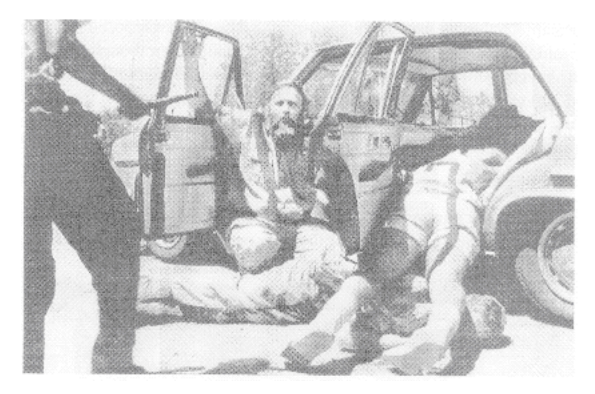
SOURCE D: A photograph showing some members of the AWB being shot by black troops in March 1994. These members of the AWB had been shooting at blacks in Bophuthatswana, a black homeland within South Africa.

SOURCE E: From the speech made by Nelson Mandela when he accepted the position of President of South Africa, 10 May 1994.