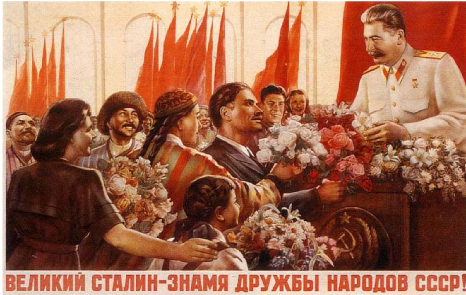
Great Stalin – A symbol of the nations of the Soviet Union