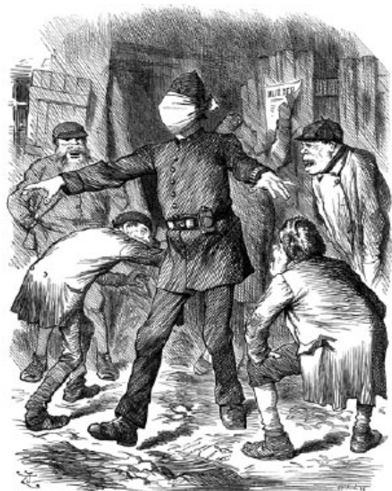
BLIND-MAN'S BUFF. (As played by the Police.) "TURN ROUND THREE TIMES, AND CATCH WHOM YOU MAY!"