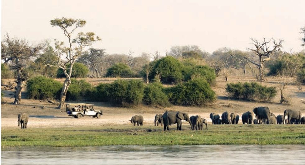
Tourist safari in Botswana

Botswana in Africa has large areas of unspoilt wilderness. Safari tourism is becoming an important source of income.