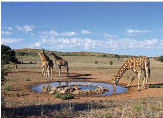
Wildlife in Botswana