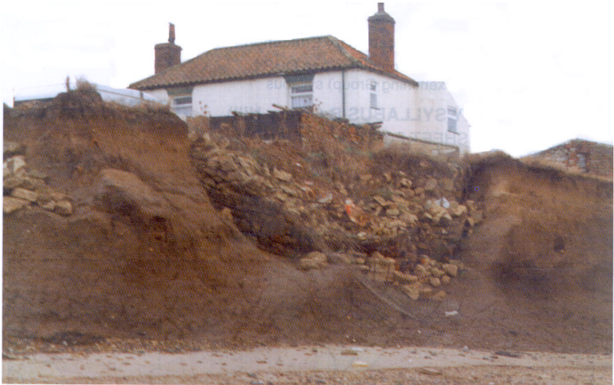
Photograph A for Question B4