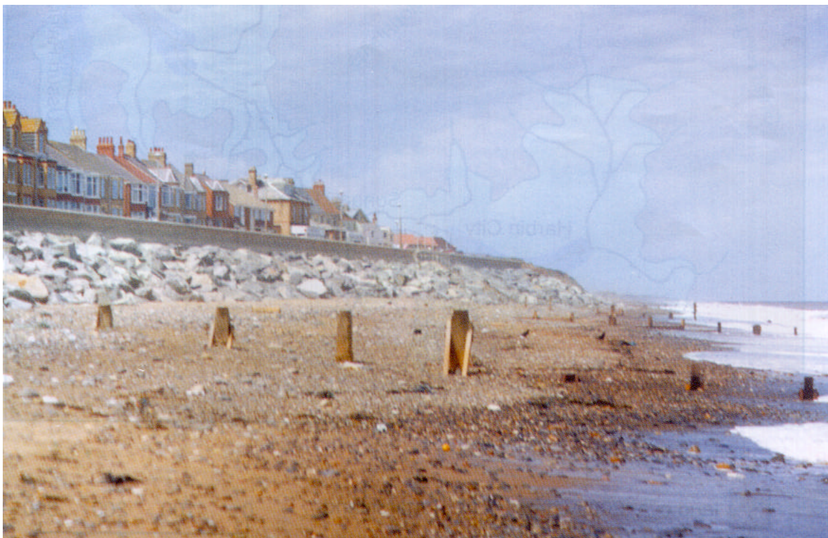
Photograph B for Question B4