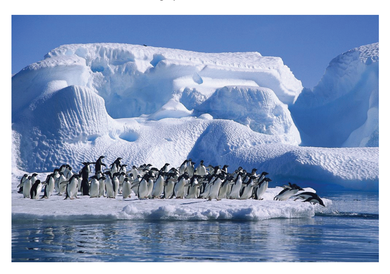
Photograph A for Question 3