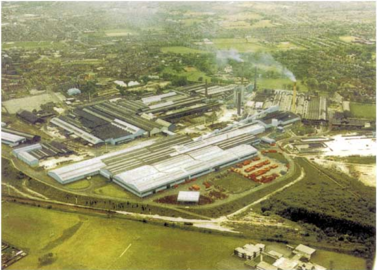
Acknowledgement: St. Helens Official Guide