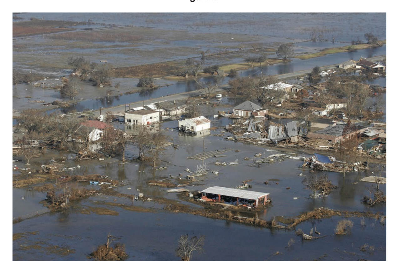
For use with Question 3 Figure 5