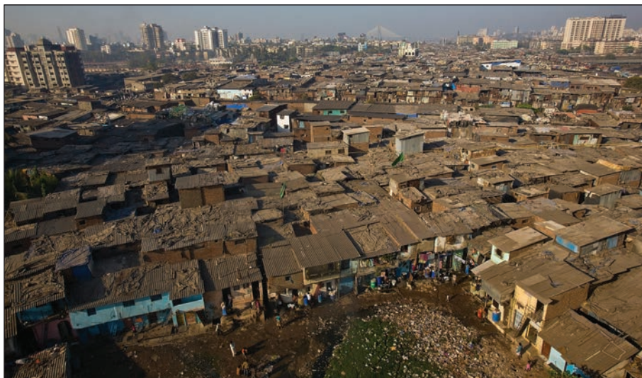
Dharavi – the largest slum in India