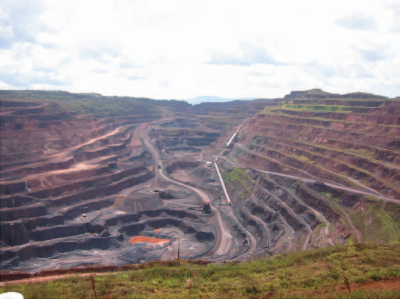
Foundation Tier – Figure 13 Higher Tier – Figure 10 (for use with Question 3)