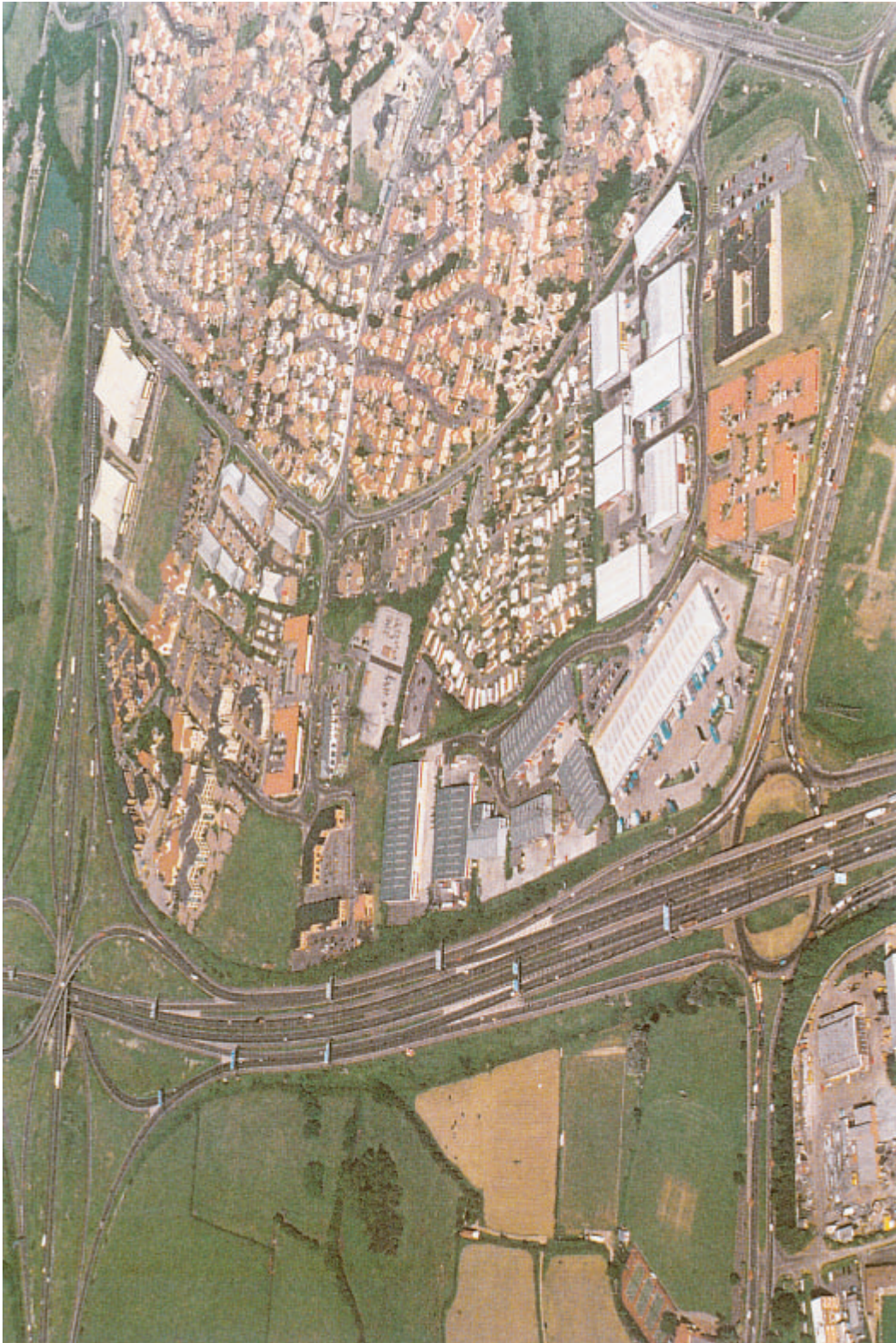
Figure 2 (For use with Question 2)