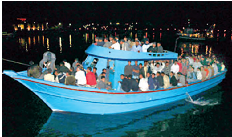
A group of refugees arriving in Italy after being rescued by an Italian fishing boat

The captain of an Italian fishing vessel is to be given a medal for rescuing 27 refugees from Somalia. The same captain had rescued 57 in November 2007. Three of the refugees drowned when their boat capsized.