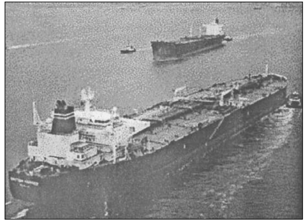
'British Harrier', a tanker capable of carrying 150,000 tonnes of oil