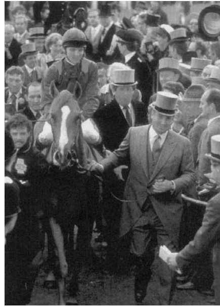
Shahrastani wins the Epsom Derby at 11 – 2