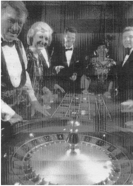
Playing roulette in a casino