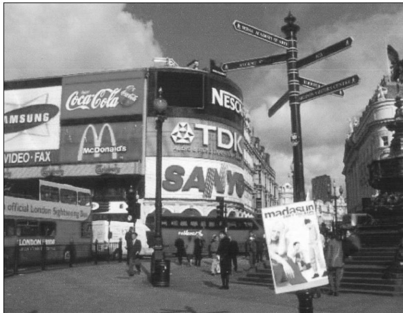
Advertising in Piccadilly Circus, London