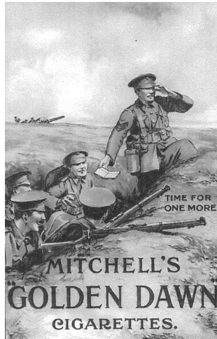
A First World War cigarette advertisement