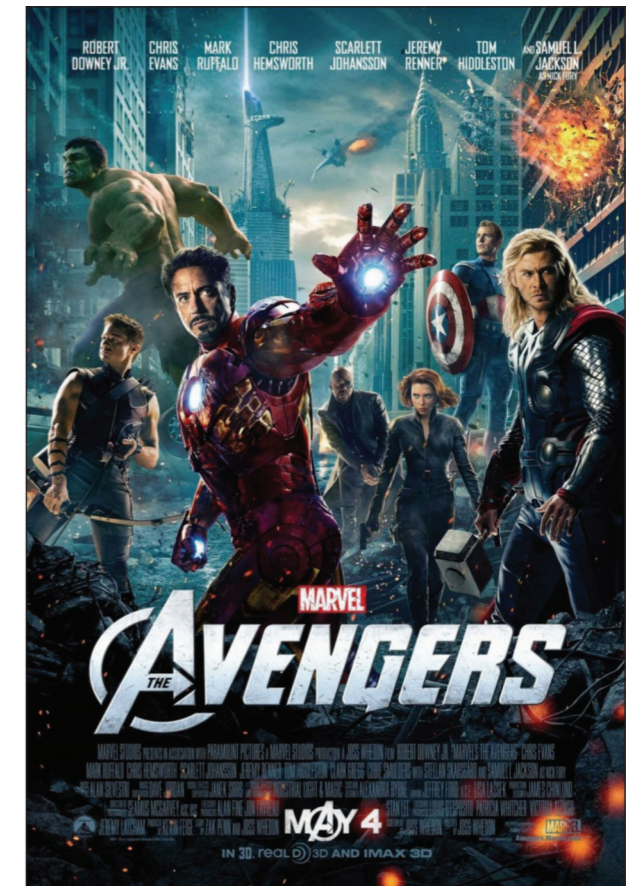
The Avengers (2012)