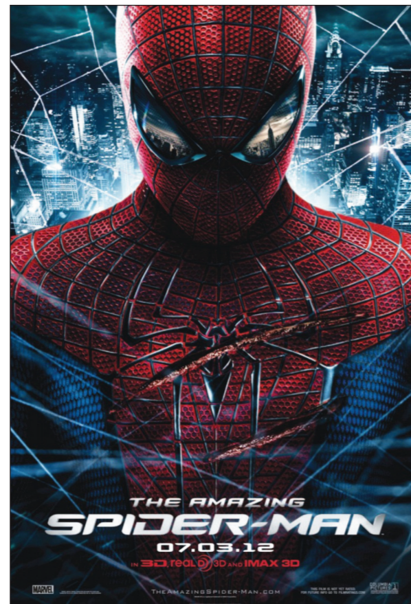
The Amazing Spider-Man (2012)