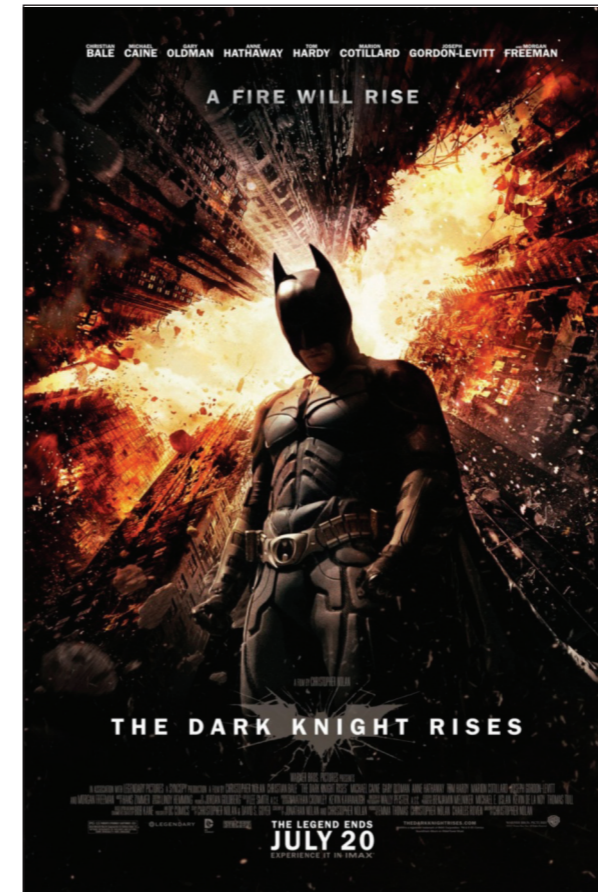
The Dark Knight Rises (2012)