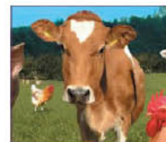
For more information about the suffering of animals, read Meat Kills .