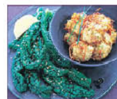
Sesame spinach with potato & parsnip balls - healthy, tasty and cruelty free