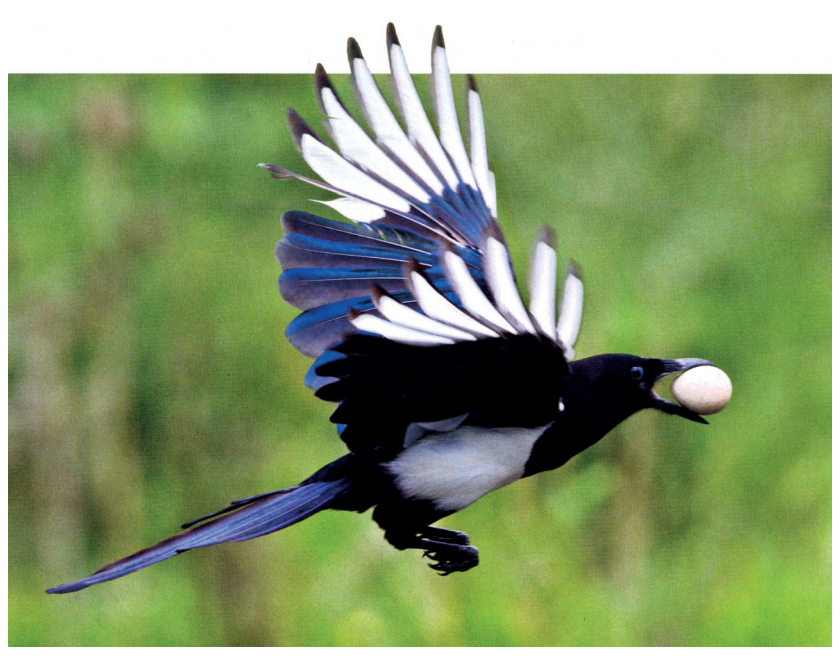
We may find egg-stealing hard to forgive, but in most cases it does little or no harm to other species.

IN THE BRIGHT sunlight, the magpie is a colourful sight. Its chest is pure and white as a swan, and its head is so dark that a pearly glint is the only sign of its watchful eye. The bird's royal blue tail fans out into a graceful curve like the blade of an African spear.