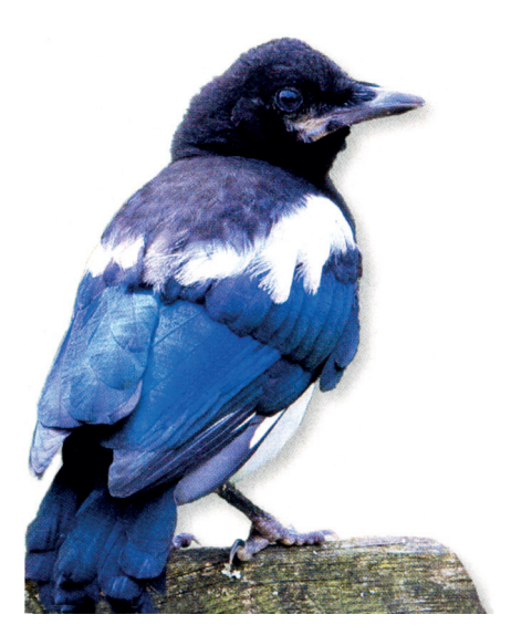
Young magpies have short, stubby tails. Their lives, too, are often short: the young birds face many dangers.