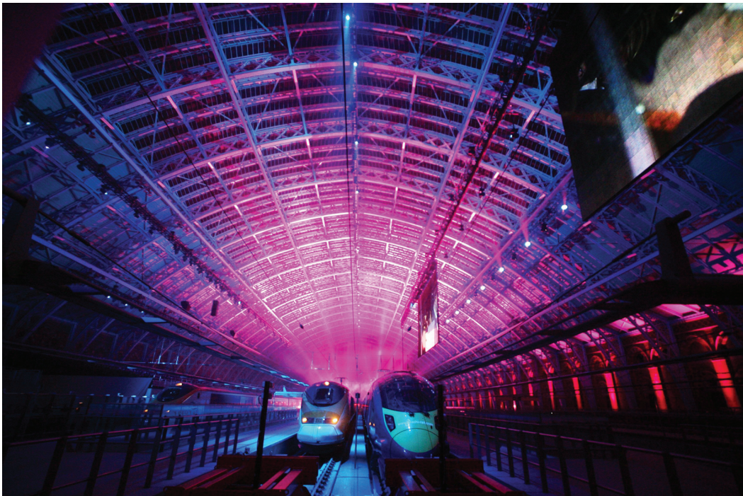
Locomotives beneath the magnificent station roof