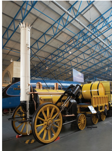
A replica of the Rocket as preserved in the National Railway Museum

It is a common mistake to say that the Rocket , built in 1829, was the first steam railway engine. The first commercially successful steam-powered engines were built by Matthew Murray for the Middleton Railway, which ran from Middleton to Leeds. George Stephenson's Rocket was a development of these.